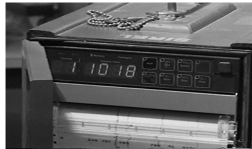
HOT SIDE of HADES PLATE. Reading: 1018°C (1864°F)

The data presented in this document is the result of tests and is believed to be accurate. This document is however a temporary and incomplete data sheet. A final data sheet will be published in due time.