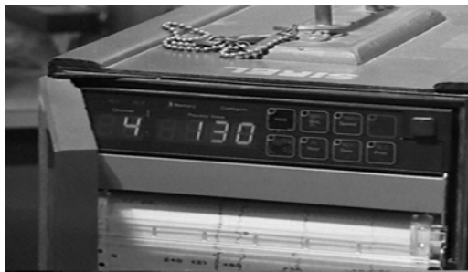
COLDSIDE of HADES PLATE. Reading: 130°C (266°F)